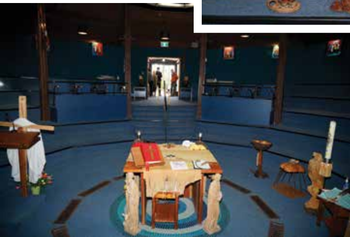
◀ The entrance seen from the sanctuary.