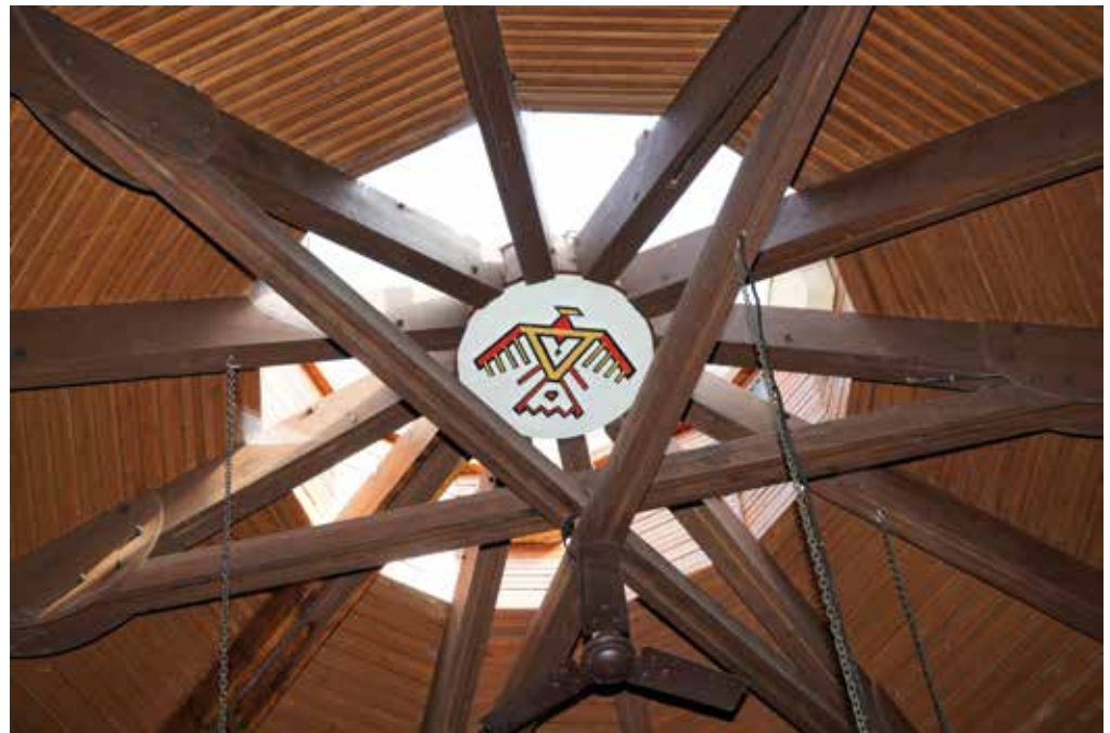
▲ The central peak of the church shows the Thunderbird of M'Chigeeng First Nation.