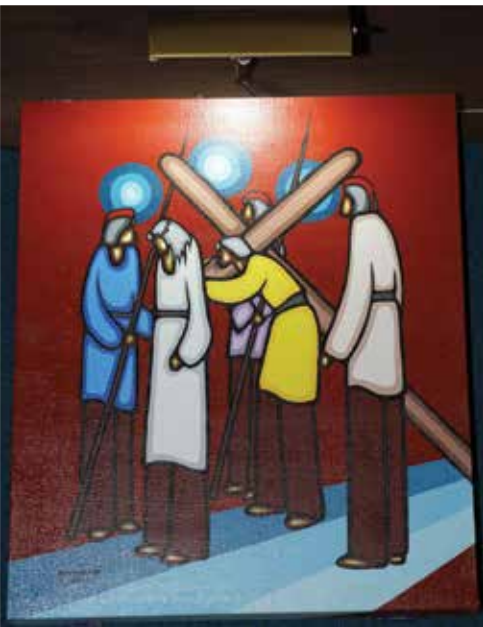
◀ Stations of the cross like this one, are represented by paintings of Leland Bell.