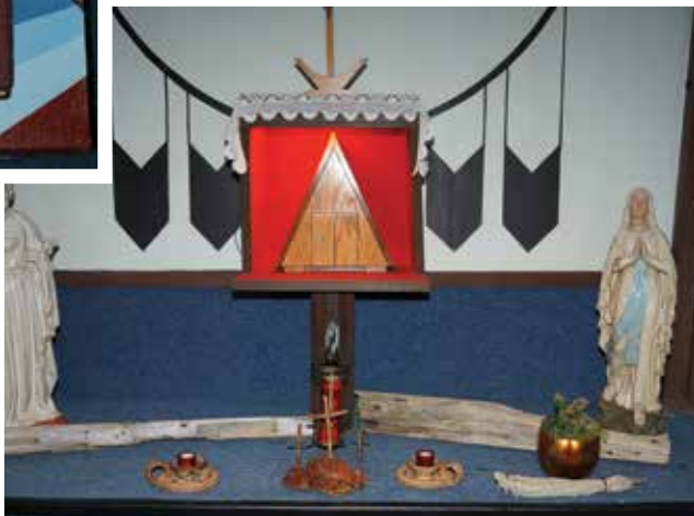
▲ Close up view of the altar.