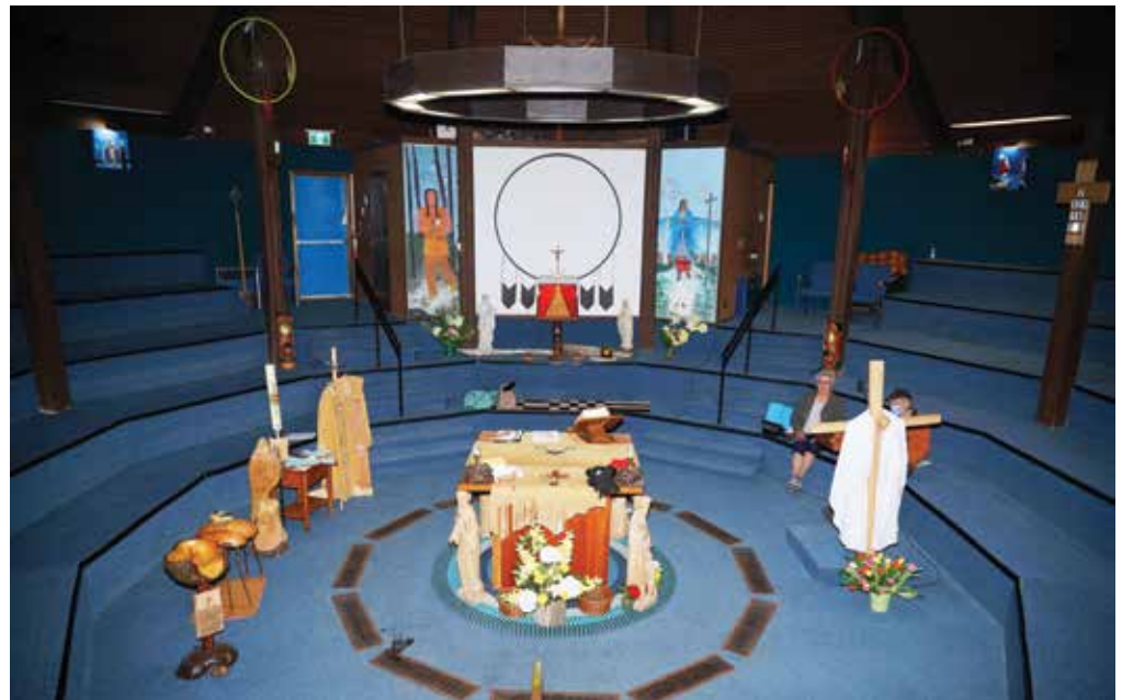
▲ Seating surrounds the sanctuary. Dreamcatchers are displayed high overhead.

Prayer is recited in both English and Ojibway. Hymns are sung in English and Ojibway. And when Father Cloutier invites parishioners to reach out to their neighbours and proclaim, "Peace be with you," it feels like something special when Indigenous and non-Indigenous alike shake hands.